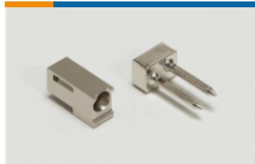
Backplane Guide Hardware(6)